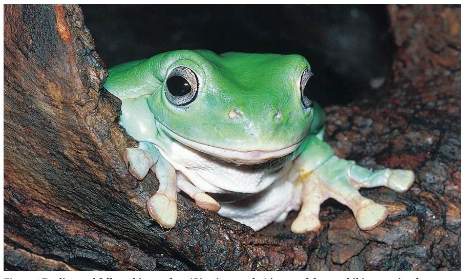
Figure 1 Decline and fall — this tree frog ( Litoria caerulea ) is one of the amphibian species that Berger et al. <sup>4</sup> have found to be infected with the chytrid fungus.

violet radiation<sup>8</sup>. Amphibian declines seem to have many causes, and it is vital that scientists do not relax their attempts to investigate these other factors — for which there is mounting evidence — in the mistaken belief that this new study has solved the puzzle.